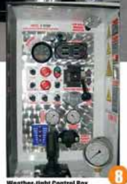
Weather-tight Control Box shown with options