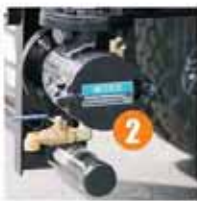
20 mesh Stainless Steel Filter