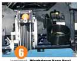
Optional Washdown Hose Reel